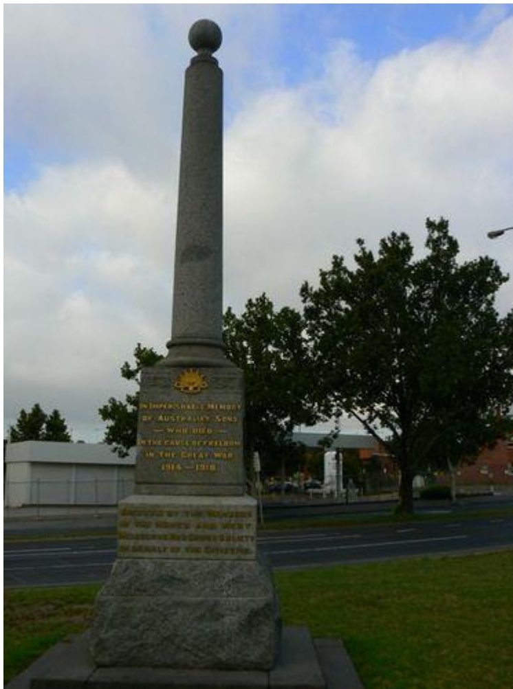
North Melbourne War Memorial

The North Melbourne War Memorial, located at King & Hawke Streets, North Melbourne, Victoria, does not list individual names.